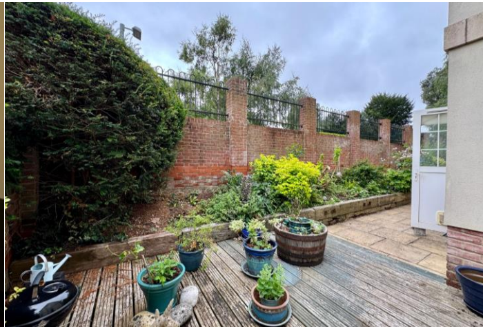
Approximate Gross Internal Area 91.54 sq m / 985.32 sq ft